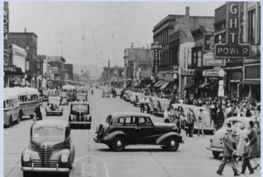
Tower Avenue 1945