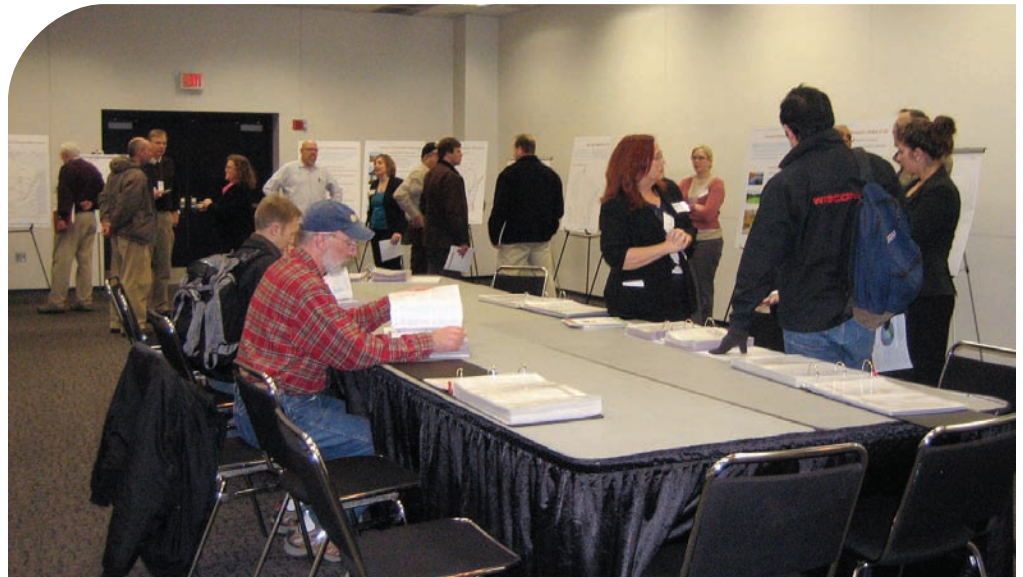
All comments received during the public comment period were entered into WisDOT's computerized tracking system and analyzed to develop a complete picture of the public's sentiments about the draft plan.

Changes to the draft plan included modifications to the plan's policies, clarification of plan content, and minor grammatical revisions and corrections. One key change was the plan's policy on intercity passenger rail. Because of the overwhelming response to this topic during the public comment period, the draft plan