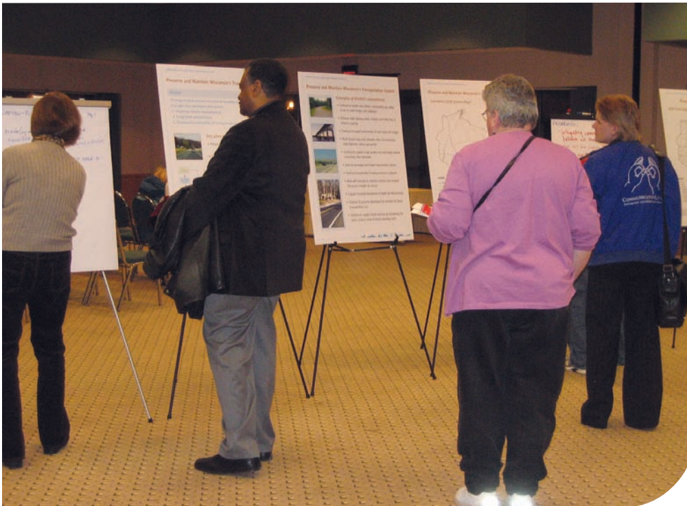
Approximately 100 people participated in meetings WisDOT conducted with organizations that represent minority, low-income and senior citizen groups.

At each meeting, WisDOT presented an overview of the plan and sought feedback. About 100 people participated in these meetings. Some issues raised by minority, low-income and senior citizen groups included: