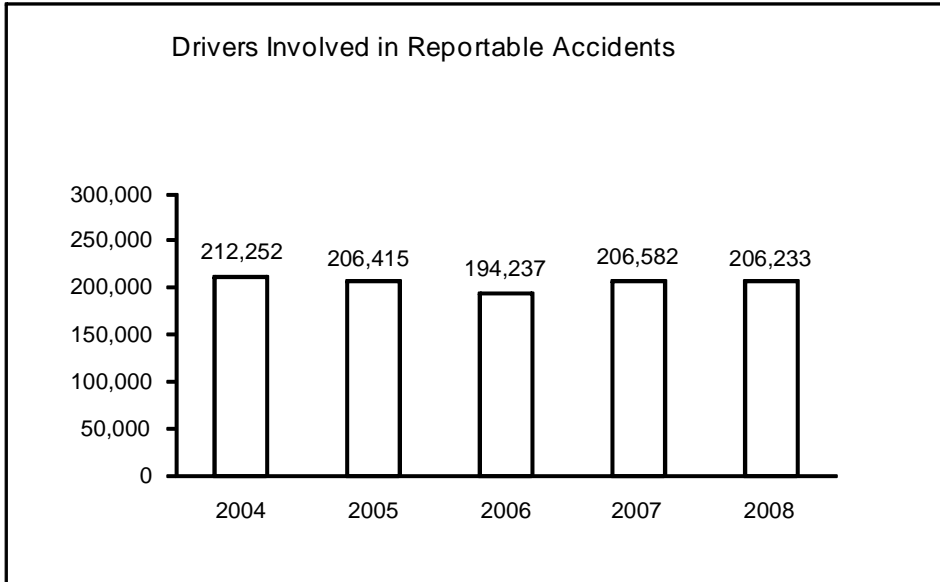
Source: Bureau of Driver Services, Traffic Accident Section